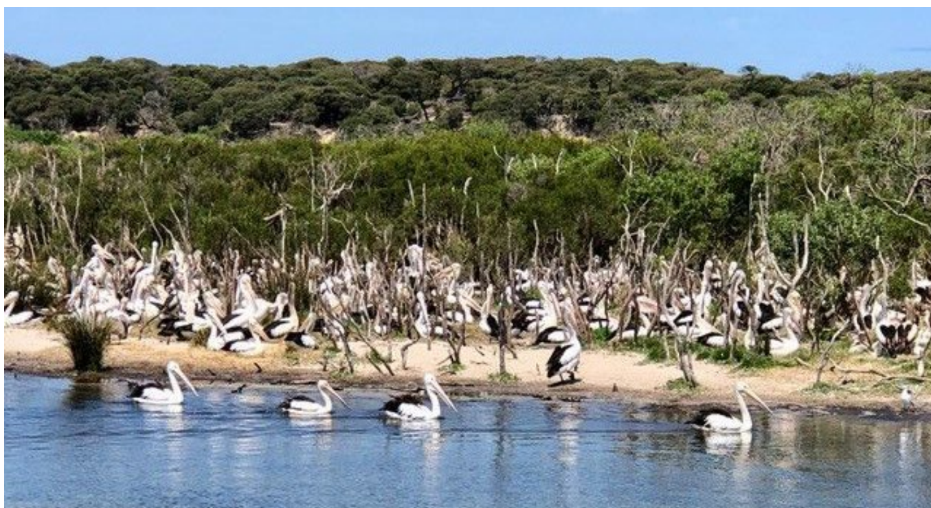
Pelicans in Gippsland