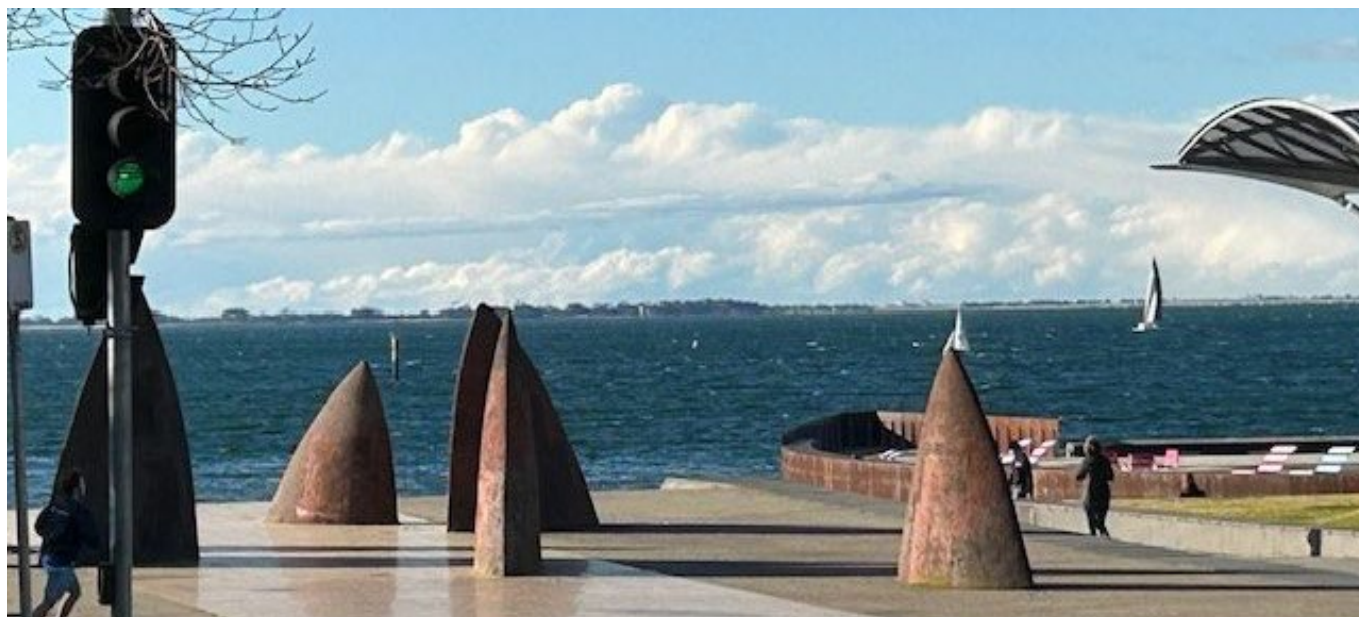
Figure 2: Geelong Foreshore

There was no overseas travel by VMaCC members for VMaCC purposes in 2023-24.