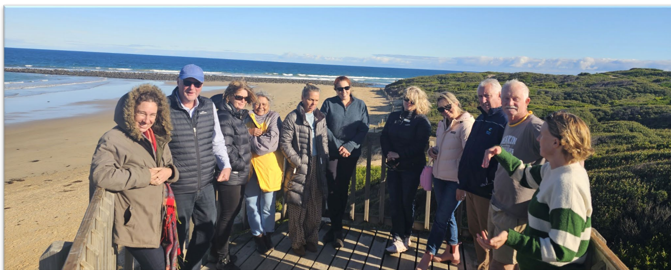
Figure 1: Site visit to Bancoora Surf Life Saving Club