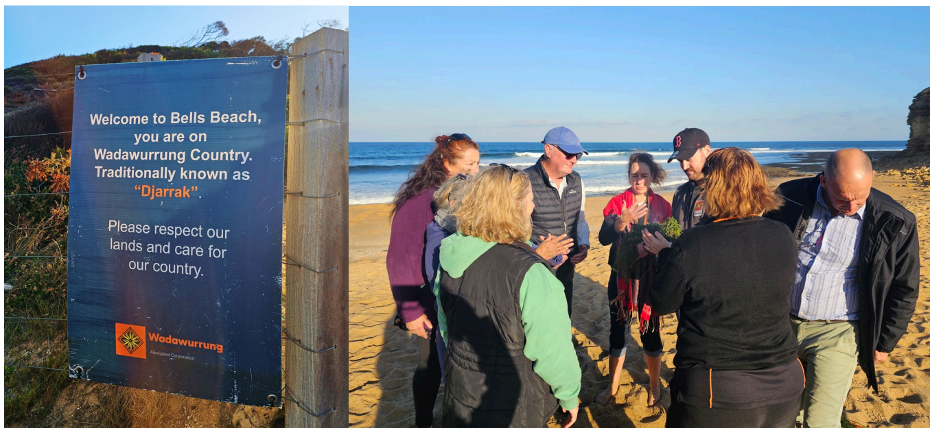
Sea Country Walk and Talk with Wadawurrung Traditional Owners Aboriginal Corporation (Djarrak, May 2024)