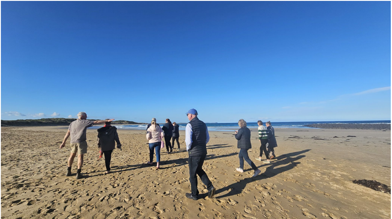
VMaCC Site Visit – Bancoora Beach (May 2024)

Council members were also very active in presenting at conferences and attending briefing meetings with communities of interest to share updates on climate change adaptation and the findings of the Kompas Report.