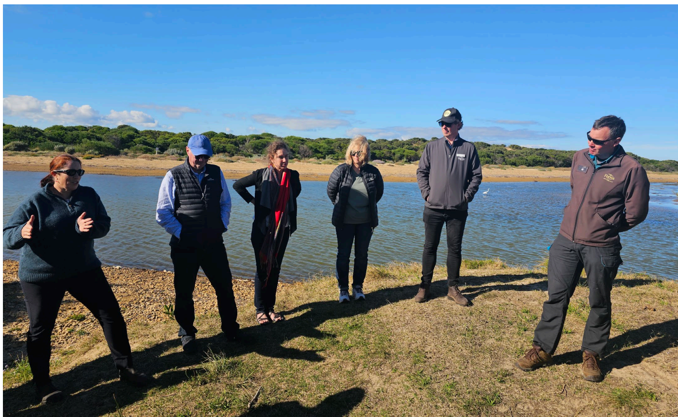
VMaCC Site Visit - Thompson Creek Estuary Opening (May 2024)